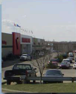
■ walk to shopping