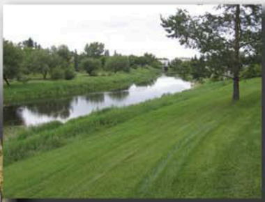
■ river settings